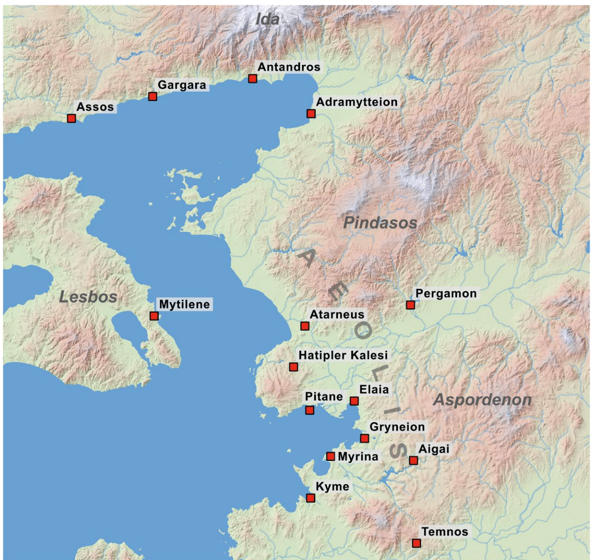
Pergamon and the Aeolis