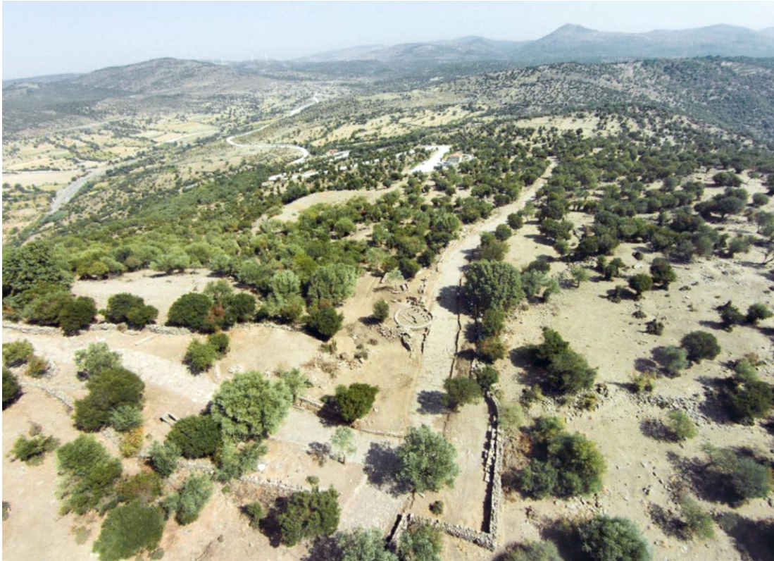
10 View of the great necropolis of Aigai with the Hellenistic and Roman funerary road in the centre

ondary road connects the north gate and the sanctuary of Meter-Kybele. It separates the necropolis from a newly terraced area of settlement or cultivation that covers the southern slope of the hill. The necropolis is now organised along these two paths, and especially along the main paved road, which crosses the entire funerary space, and which turns towards the north-west, towards the coast and towards Pergamon.