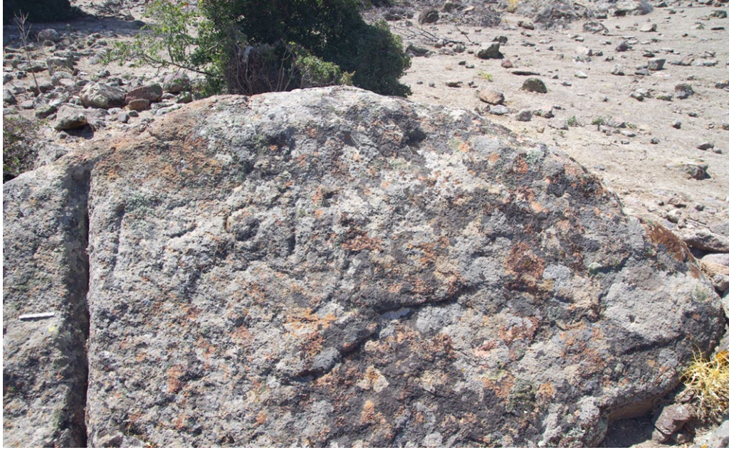
8 The inscription associated with the megalithic monument

of Aigai, it will undoubtedly play an important role in the study of the definition of sacred spaces in the Greek world and their place within the funerary space.