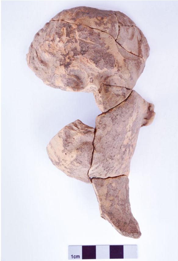
9 Hellenistic terracotta votive head from the orientalisering mound excavated in 2015

probable foreign productions rare in Anatolia (the Macedonian beads). The series of Phrygian type fibulae is interesting because it combines characteristic examples of Ionian production and a variant without equivalent, perhaps made locally. The ensemble thus gives a precise picture of the cultural identity of a homogeneous group in the Inner Aeolian at the beginning of the Orientalising period.