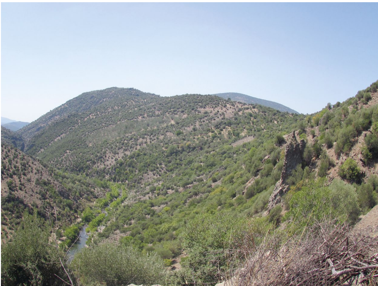
1 The citadel of Aigai (left) and its necropolis (centre) with the Kocaçay valley, seen from the northeast