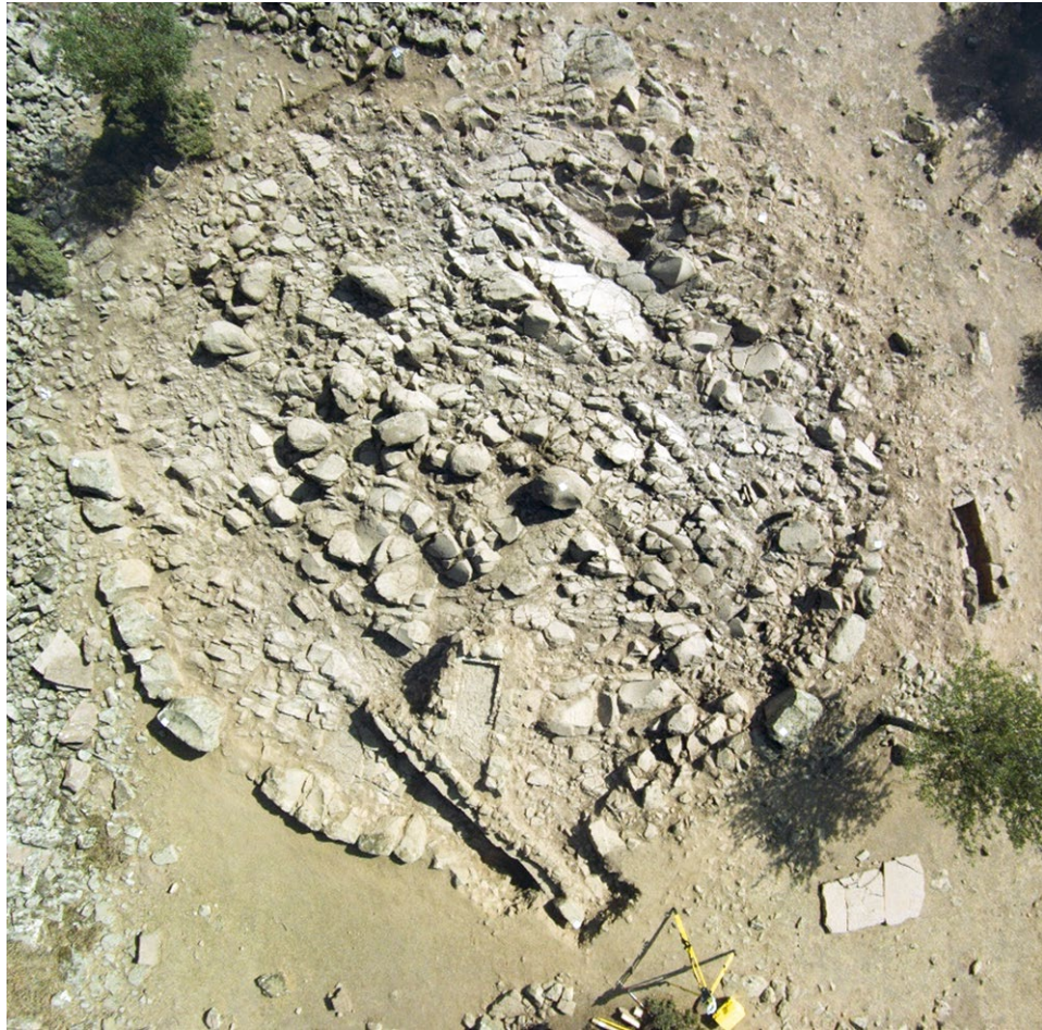
5 A tumulus from the Orientalising period that was reused in the late Archaic and late Hellenistic periods

traces of artisanal activities (concentrations of ceramic firing scraps).