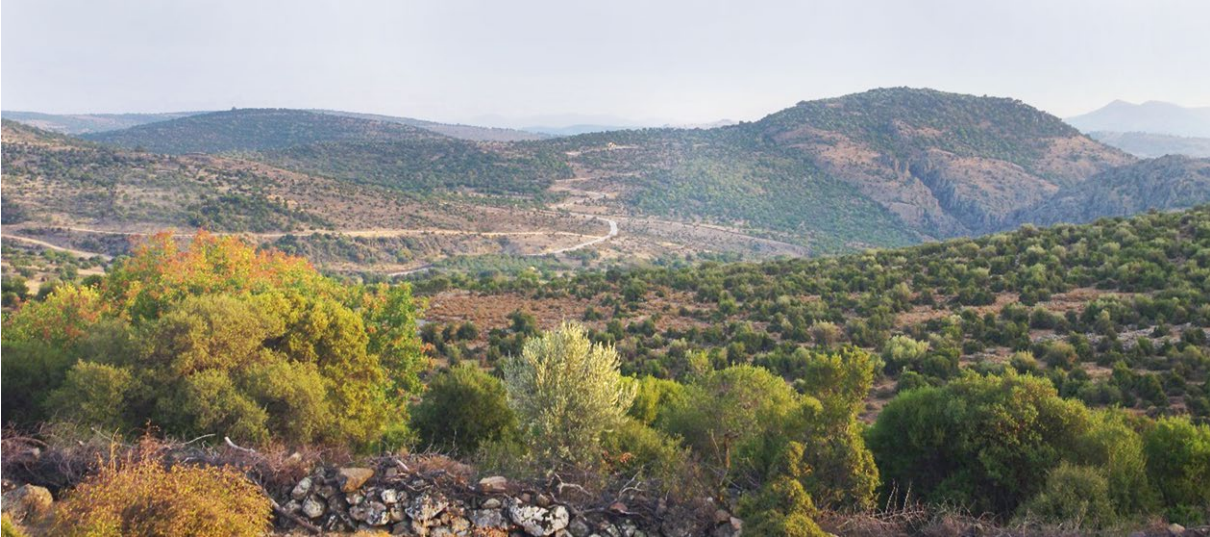
6 The city (right) and the great necropolis (centre and left) seen from the road to Gryneion

to the coast and inland: towards Myrina, Kyme and Temnos to the south; towards Gryneion and Pergamon to the northwest; to Magnesia ad Sipylum in the northeast.