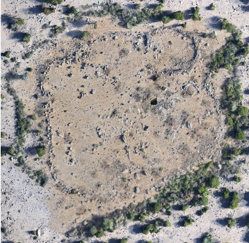
7 Photogrammetric view of the ›megalithic‹ monument of the necropolis of Aigai

right stone surround, of a large rough block in place that was part of the bedrock (fig. 8). This type of outcrop is particularly common in and around the enclosure. Some structure the space, such as the alignment that divides the internal space at about its centre.