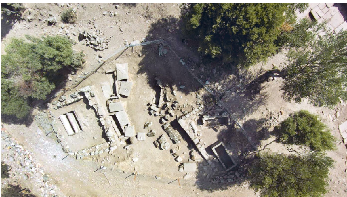
2 The burial enclosures excavated in 2005 near the main burial road