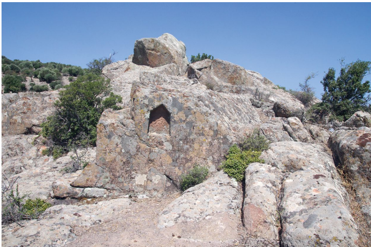
4 Cult structure cut into the bedrock in a probable area of an extra-urban sanctuary

well-preserved necropolises in western Anatolia; patrimonial on the other hand, because it has been the object of massive looting since the Byzantine period, which has multiplied since the second half of the 19 th century; and finally touristic, because it will be part of a route that will include the city itself, its necropolis and its main extra-urban sanctuary.